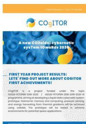
ISSUE N. 2: May 2022