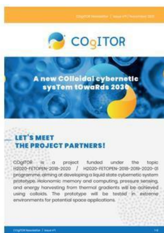
ISSUE N. 1: November 2021