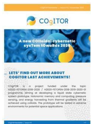
ISSUE N. 3